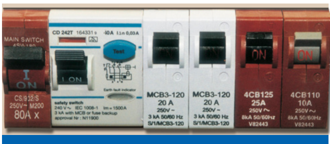
Figure 1 Typical switchboard with the main switch, safety switch with test button, and four circuit breakers.

Circuit breakers and safety switches should only be reset after first checking for damaged or unsafe electrical appliances or a reason why the safety switch or circuit breaker was triggered.